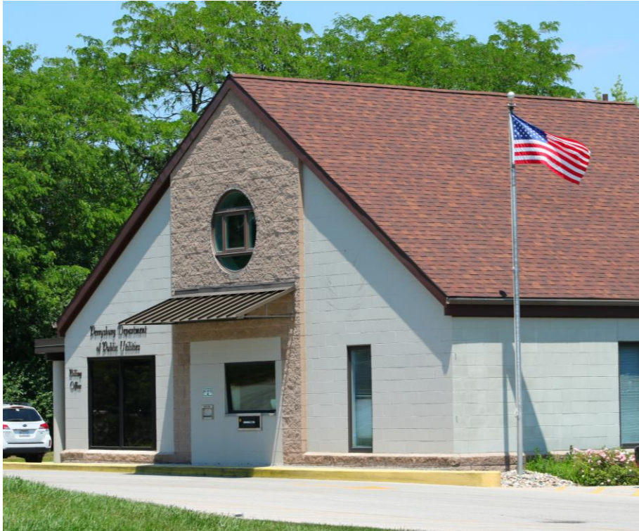
Dept. of Public Utilities